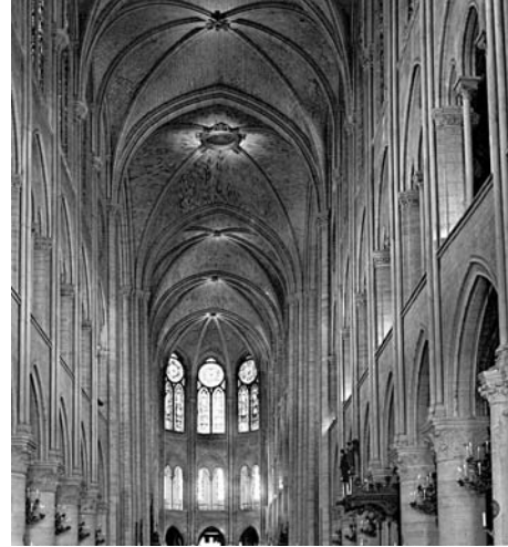
Figure 2: Nave of Notre Dame de Paris, showing the repetition of elements.

The outline of the ARC system is the result of close collaboration between architectural historians and artificial intelligence researchers. While the system is still in its infancy, the complete ARC system will have three distinct modes of interaction, to be used by three different types of user. We will refer to